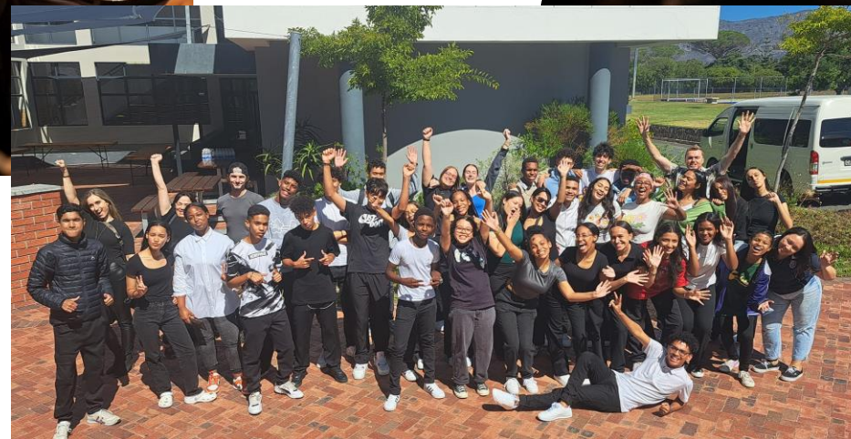
V&A Waterfront 2024 Band Slam winners