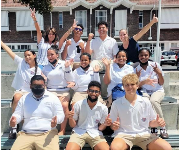
The official winners of the 2022 Tug of War Senior Finals - VEGA 2nd place TAU 3rd place AQUILA 4th place INDOSA