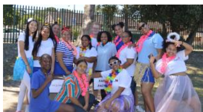
Some of the amazing ladies we have at Bergvliet High School